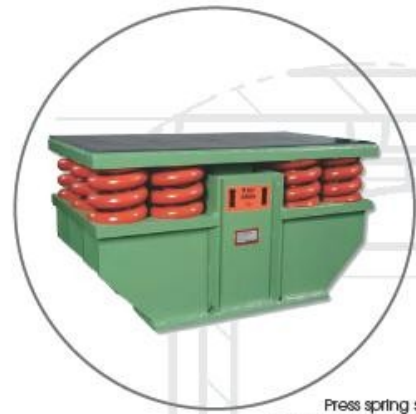
Press spring support for loads of up to 250 tons

Hyundai, Daimler Chrysler, VW, GEA-Westfalia, Kraus Maffei AG, Klink, Mazda