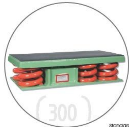
Standard spring support with viscous damping