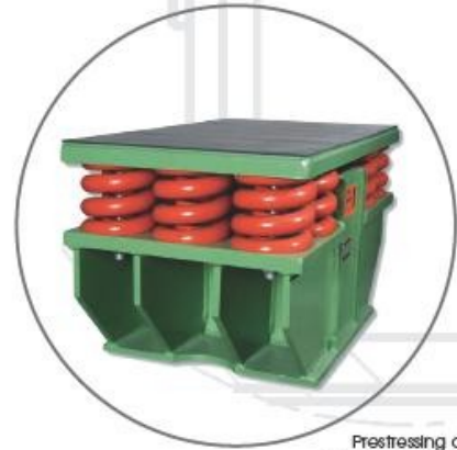
Prestressing area on the press spring support