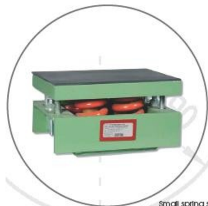
Small spring support for loads of up to 10 tons